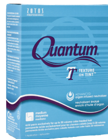
Texture on Tint