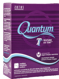
Texture on Tint Acid