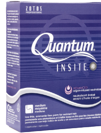
Insite Resistant Low thio