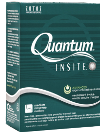
Insite Normal Low thio