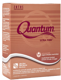
Ultra Firm Exothermic