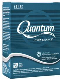
Hydra Balance Hydrating Alkaline with Replenishing Pre-Treatment