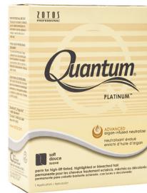
Platinum Specialty perm with Reconstructive Pre-treatment