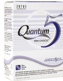
Firm Choices Buffered Alkaline