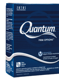
Firm Options Buffered Alkaline