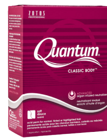
Classic Body Acid