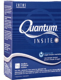
Insite Delicate Low thio with Equalising Pre-wrap