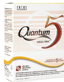
Mega Firm Exothermic