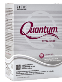
Extra Body Firm Acid